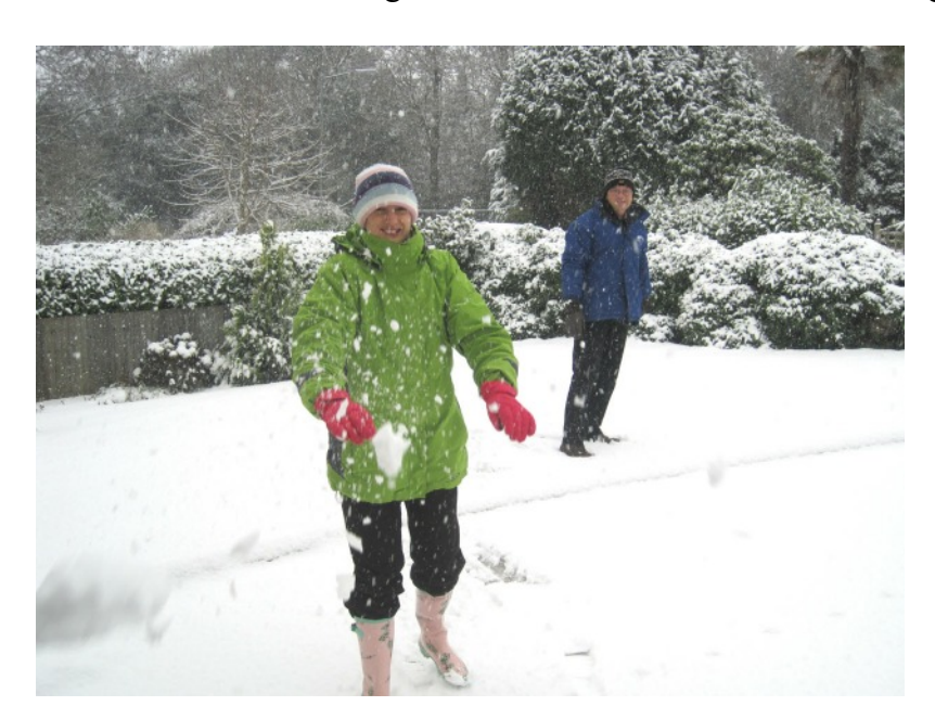
The snowy site of my weather station in Penzance 10:00 on 2nd December

Overnight 1<sup>st</sup>/2<sup>nd</sup> December, the wind backed NNE, and snow showers which had been running south westwards just off the north coast of Cornwall were brought inland across west Penwith, as well as the Isles of Scilly. Frequent and sometimes heavy snow showers continued in Penzance from 02:00 to early afternoon. There was around 6cm of fresh snow lying at my station at 09:00. Just a couple of miles to the SE at Marazion, there virtually no fresh snow, as the South east edge of the snow remained virtually stationary for around 8 hours. 15cm of snow fell just behind Penzance, with some parts of the highest ground towards St Just and Sennen seeing even more. There was even a covering of snow on Scilly.