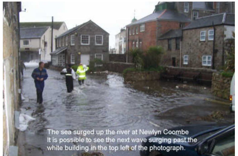
The sea surged up the river at Newlyn Coombe. It is possible to see the next wave surging past the white building in the top left of the photograph.

The damage to the sea defences between Penzance and Mousehole, a 4 mile stretch of the coast heading towards Land's End, was considerable. Holes of various sizes appeared as a result of undermining, and several parts were slipping, all the way along this stretch. The main road into Mousehole was in danger of subsiding into a particularly large hole.