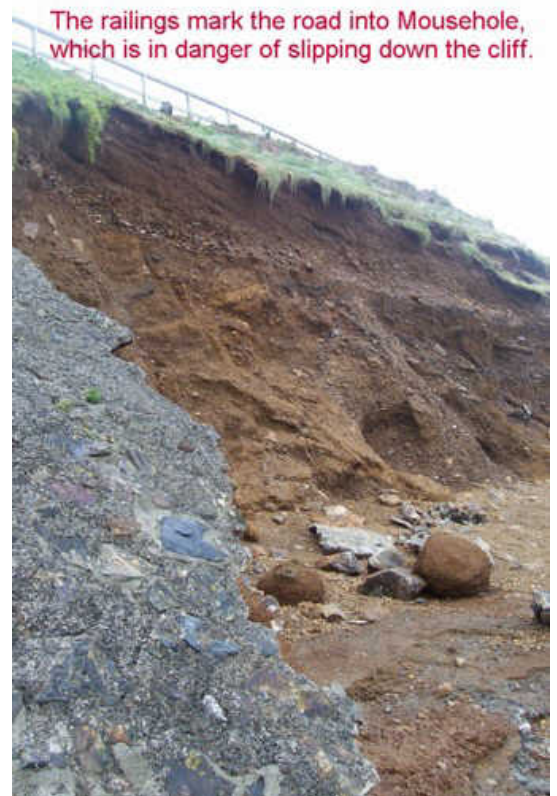
The railings mark the road into Mousehole, which is in danger of slipping down the cliff.