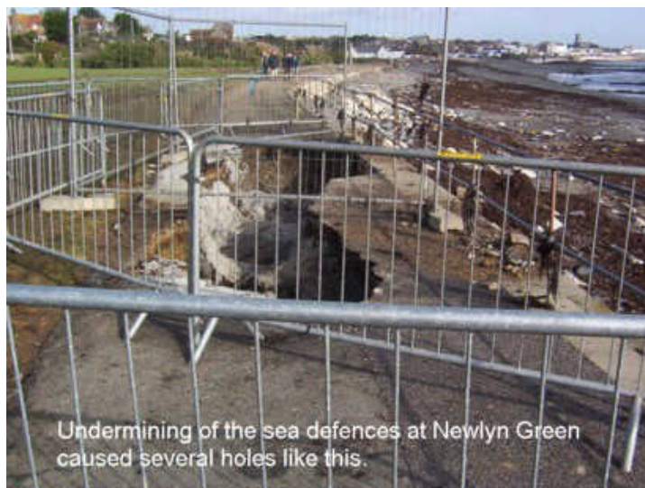
Undermining of the sea defences at Newlyn Green caused several holes like this.

The damage to the sea defences between Penzance and Mousehole, a 4 mile stretch of the coast heading towards Land's End, was considerable. Holes of various sizes appeared as a result of undermining, and several parts were slipping, all the way along this stretch. The main road into Mousehole was in danger of subsiding into a particularly large hole.