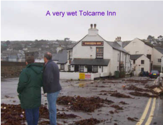
A very wet Tolcarne Inn